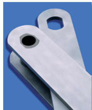
Example: Patented T-Alpha cut-outs

THIELE engineers provide on-site consulting and analysis in conjunction with the customer for any particular conveying problem/s at hand, thus helping customers find an optimally engineered mobile chain system for the particular application. Subsequently, the customer/site-specific technical solution is developed in detail by THIELE engineering staff.