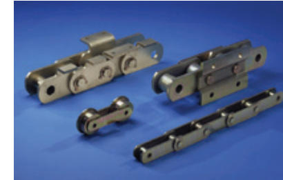
Plate link chains